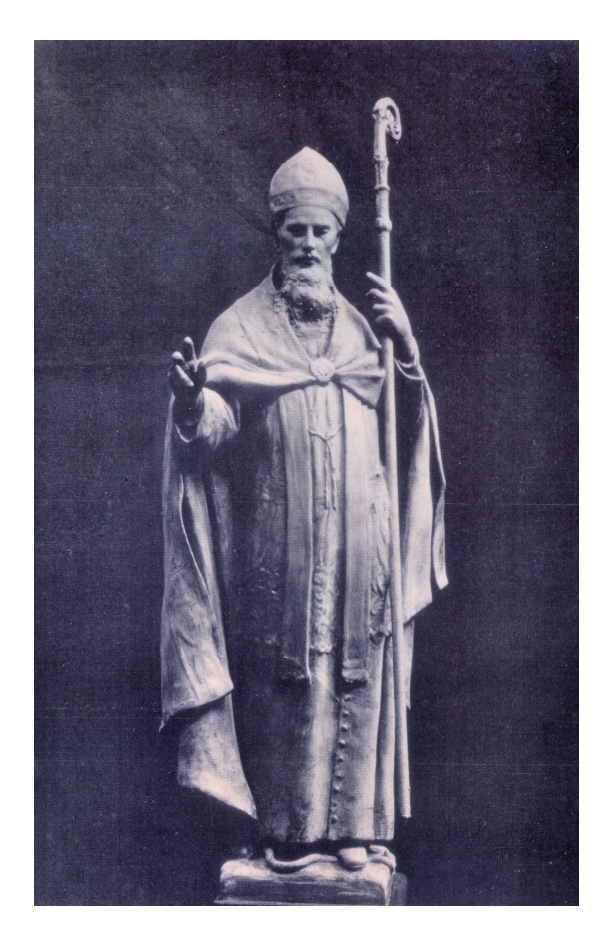
Fig. 4c: St Patrick, Sacred Heart church, Thornton-le-Fylde